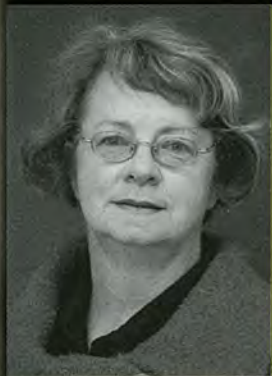
Marie Wilson Costumes